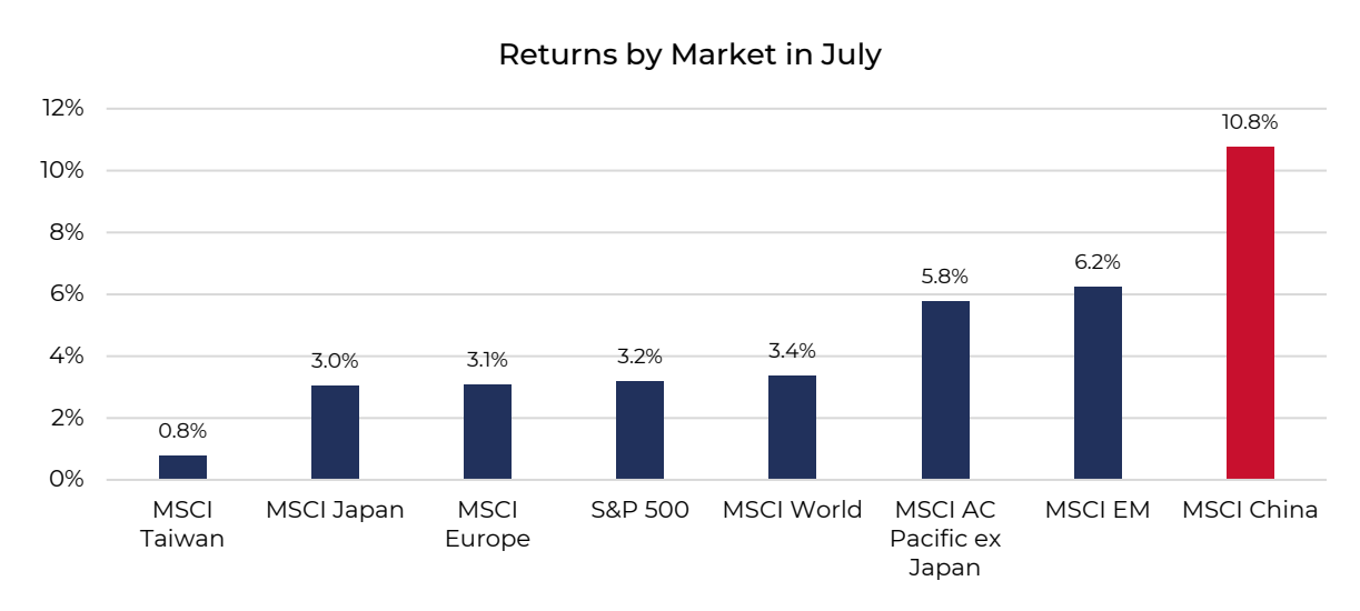
(Data from 06/30/23 to 07/31/23, returns in USD, source: Bloomberg, Guinness Atkinson calculations)

In July, the MSCI China Index rose by 10.8% compared to the MSCI World Index which rose by 3.4%. Chinese markets were strong on expectations of greater stimulus for the housing market and wider economy. The readout from the Politburo's meeting acknowledged "insufficient domestic demand" and mentioned the need for counter-cyclical economic policy. The need to support the private sector was mentioned, though actions rather than rhetoric are needed at this point. The phrase "housing is for living, not for speculation" was removed from the statement, which was interpreted by most as a sign more easing measures for the property market are on the way. We saw relief measures for the property market extended for a year. For example, banks can extend the maturity of loans to developers and do not need to raise the risk classification of loans. While this is encouraging, we await more specific easing policies.