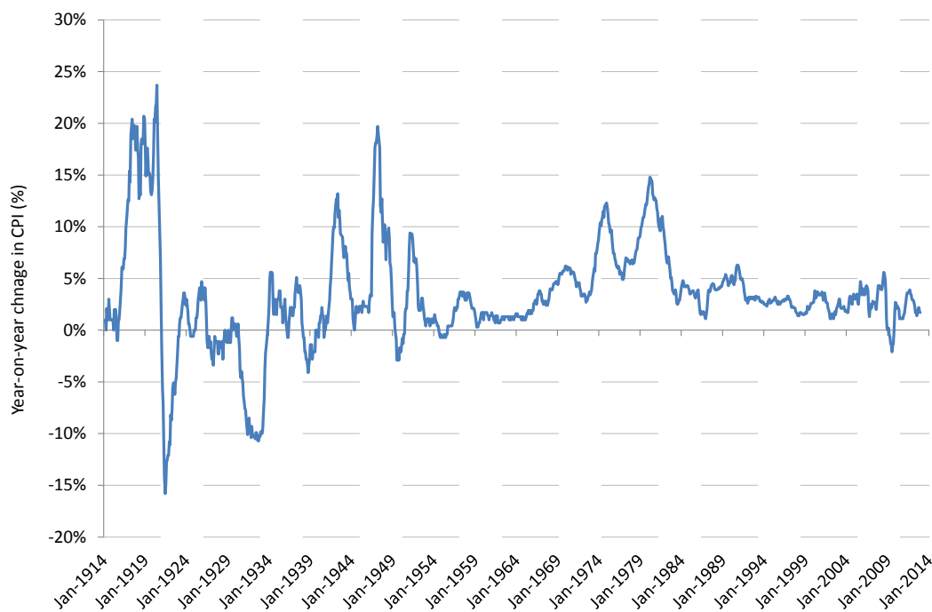
Year-on-year change in US consumer price index (CPI)

Source: Bloomberg, Guinness Atkinson Asset Management