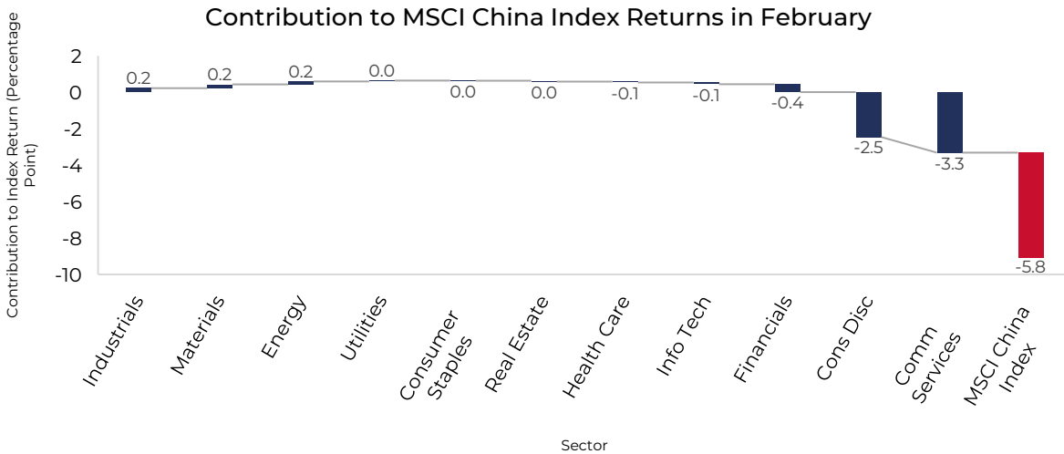
(Data from 01/31/26 to 02/28/26, returns in USD, source: Factset, Guinness Atkinson calculations)

In February, the MSCI China Index fell by 5.8% and so underperformed developed markets which rose by 0.7%, as measured by the MSCI World Index. The largest contributors to China's fall were: